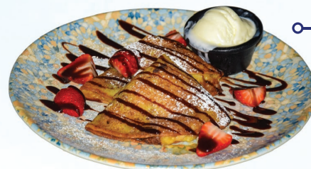
Banana & Nutella Crepes